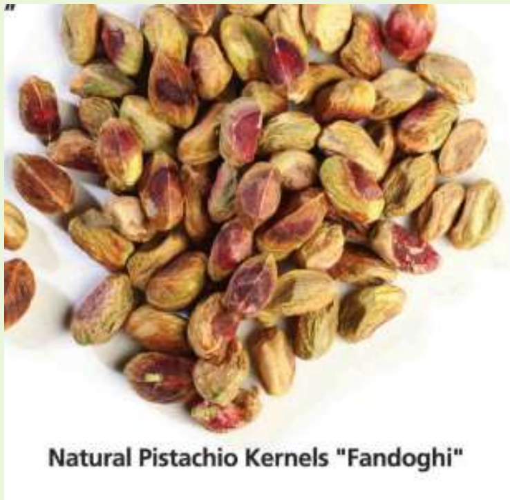
Natural Pistachio Kernels "Fandoghi"