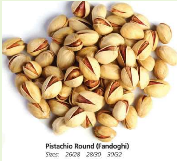
Pistachio Round (Fandoghi)