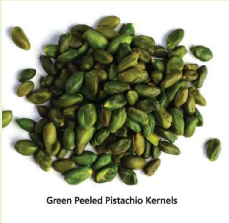
Green Peeled Pistachio Kernels